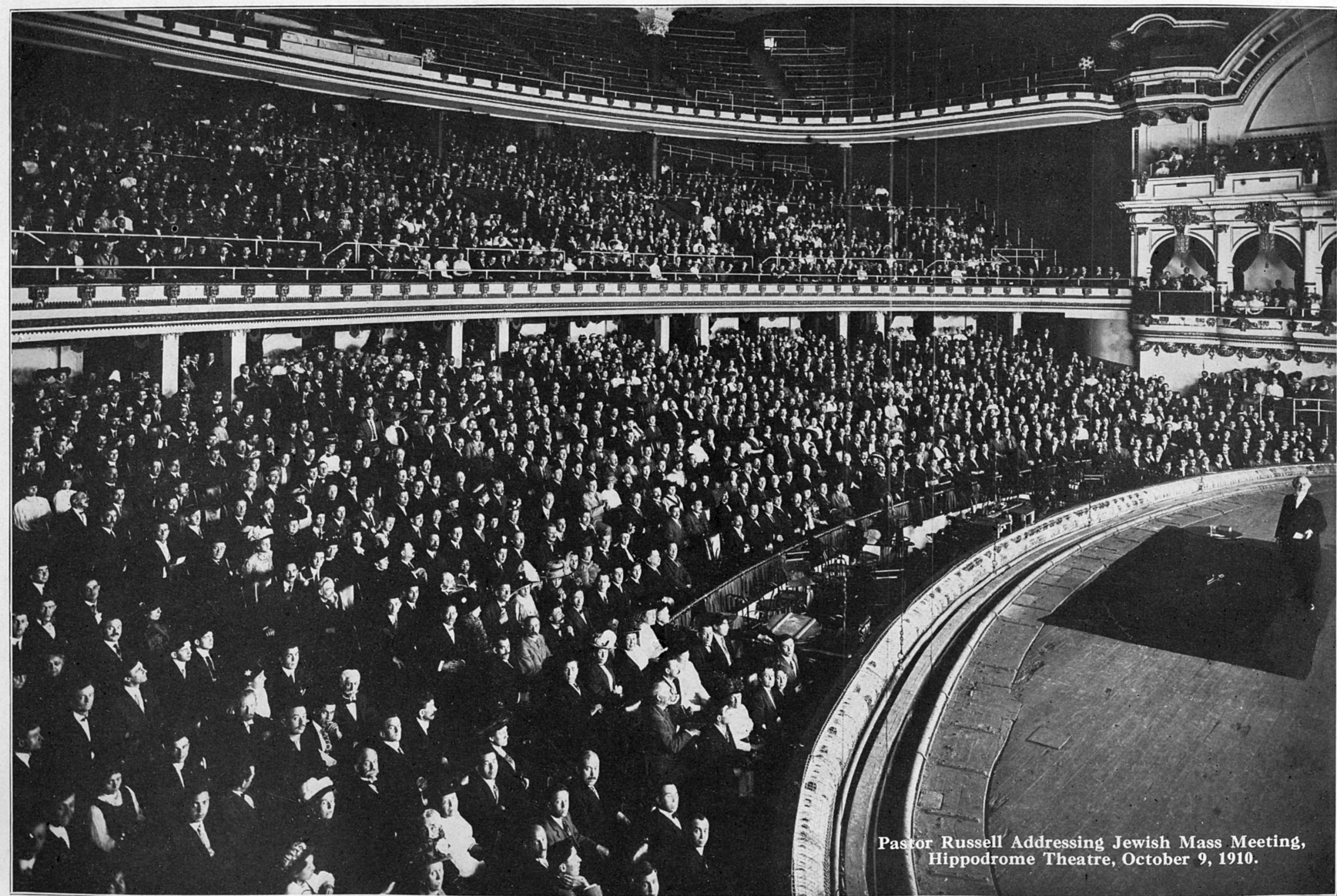
Pastor Russell Addressing Jewish Mass Meeting, Hippodrome Theatre, October 9, 1910.