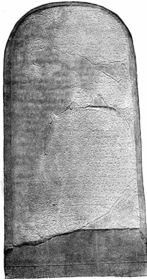
The Moabite Stone, erected by King Mesha, at Dibon.

the country east of the Jordan would doubtless bring to light inscriptions compiled in it much older than the oldest which we at present know. Only a few years ago the gap between the time when the Phœnicians first borrowed their new alphabet and the time to which the earliest texts written in it belonged was very great indeed. But during the last fifteen years two discoveries have been made which help to fill it up, and prove to us at the same time what may be found if we will only seek.