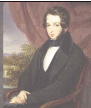
Baron Lionel de Rothschild