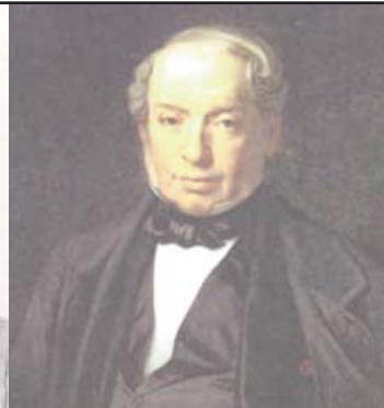
Baron Nathan Mayer Rothschild