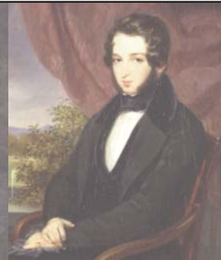
Baron Lionel de Rothschild