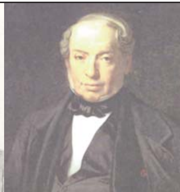
Baron Nathan Mayer Rothschild