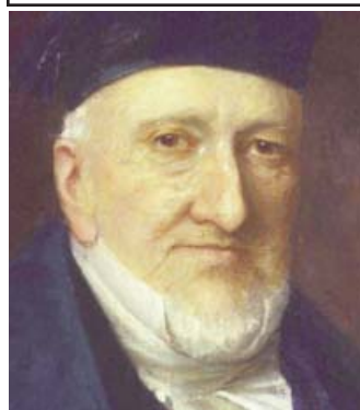
Sir Moses Montefiore